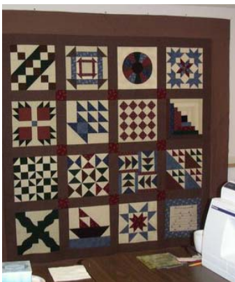
Audree finished her "Underground Railroad"